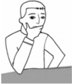
'I've got lots to get through tomorrow so I'd be better off working from home.'

collar-tugging, neck-scratching and eye-rubbing are sure signs you've just interrupted an employee doing something they shouldn't. And if their monitor shows a desktop image instead of an open document each time you draw near, chances are they're minimising open windows to 'hide the evidence' of their shirking.